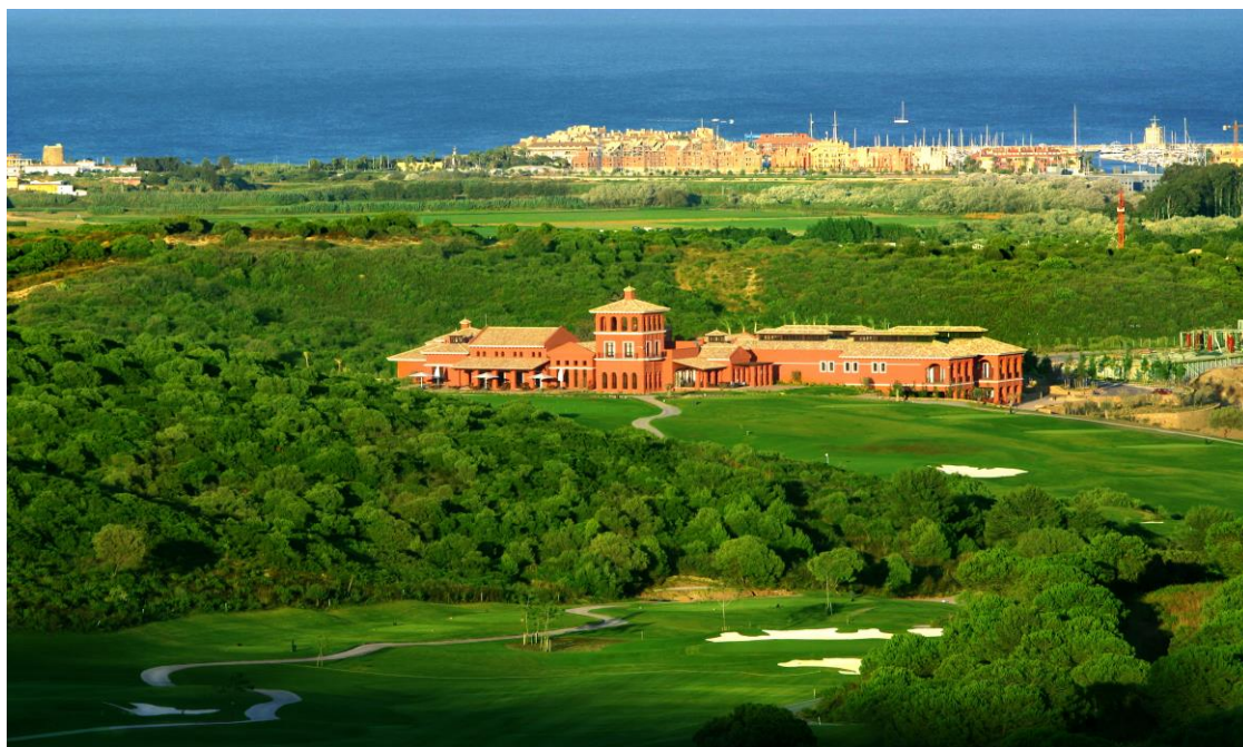
A view of the exclusive La Reserva Golf Club, Sotogrande, Spain with panoramic views to the Polo fields and the Marina

Our 2 luxury houses at Los Cortijos de la Reserva by the entrance to the La Reserva Golf Course are available for rental.